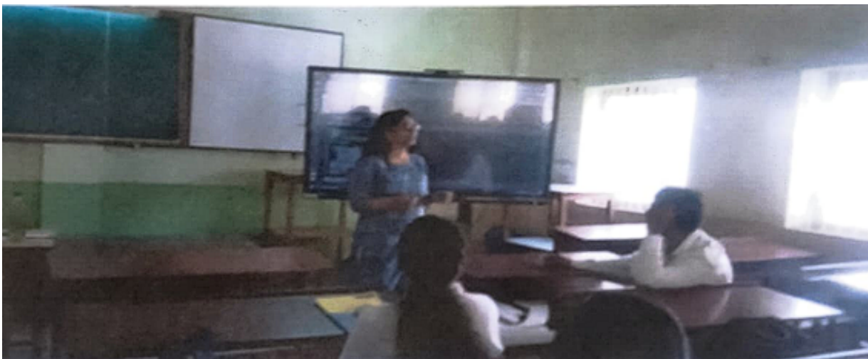
Demonstrating SVM classifier for Image Dataset

PO's Mapped: PO1, PO2, PO3, PO4, PO5, PO12