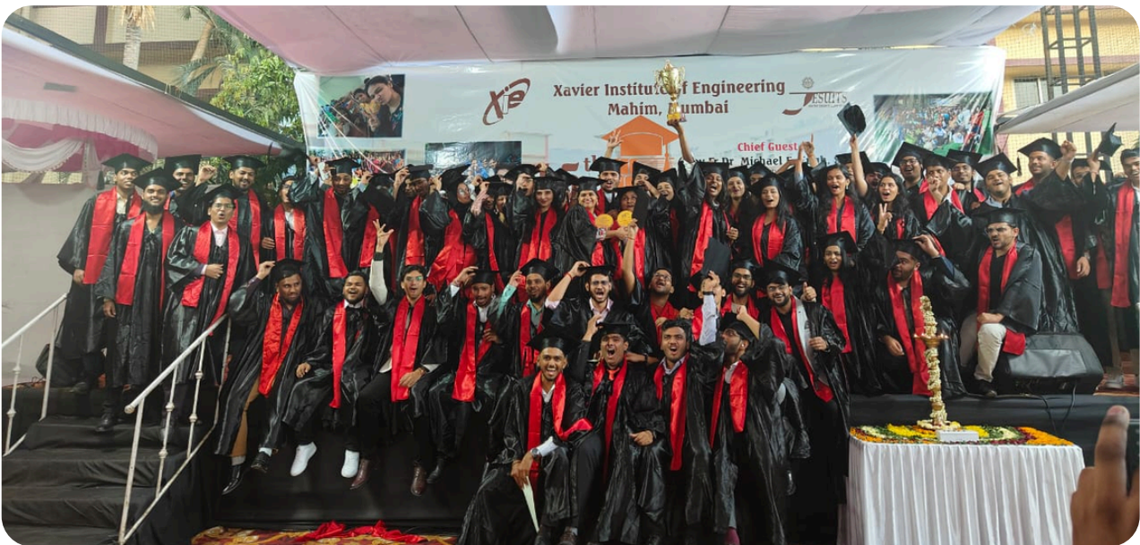
IT Graduates of Batch 2023 received an award for Best Department