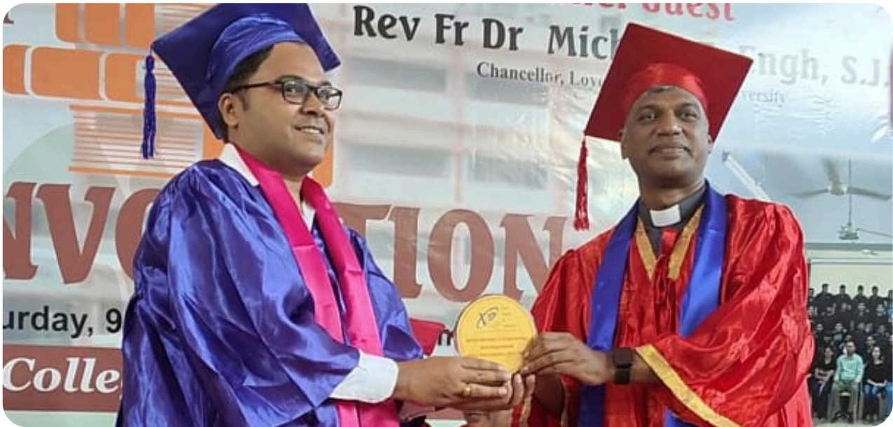
IT Graduates of Batch 2023 received an award for Best Video