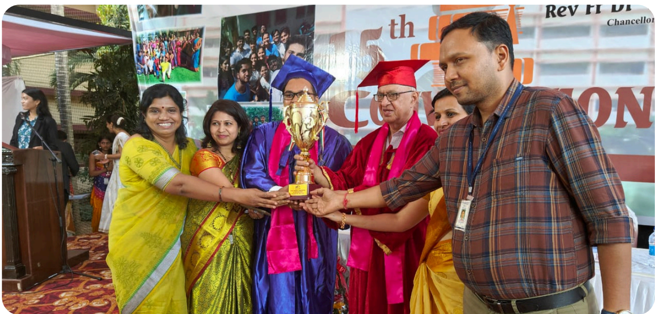
IT Graduates of Batch 2023 received an award for Best Result