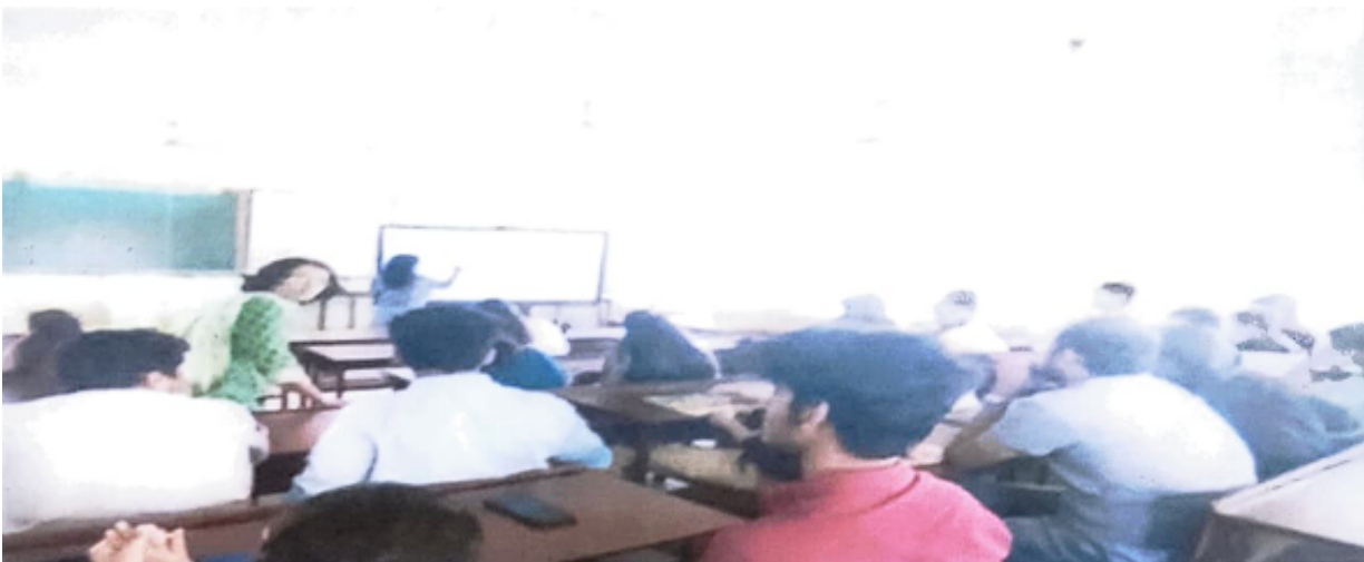
Doing SVM Numerical on Smart Board

Objectives: The objective of an understanding SVM Fundamental such as define what Support Vector Machines are and their significance in machine learning. The institution behind SVM and its geometric interpretation. Describe the basic components of SVM such as hyperplanes, margins, support vectors. and kernel functions and demonstrate their ability to solve real-world problems using their technical knowledge.