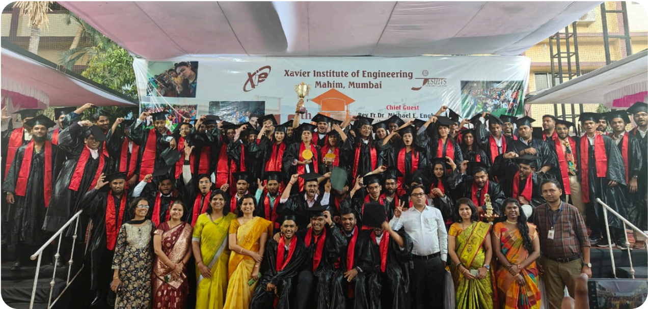
IT Graduates of Batch 2023 along with the IT faculty